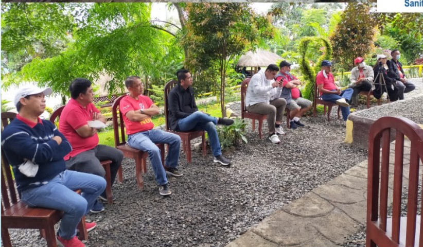
March 6, 2021 Formal Turnover of “Water System Project” for IP Scholars of Mapantow Community Center at Upper Kibalang, Marilog District, Davao City.